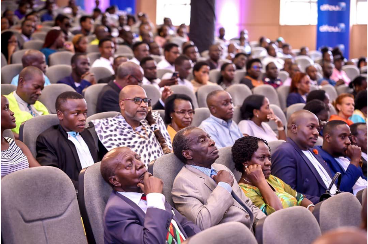
Cross-section of the audience at the 2nd Annual Nsibirwa Public Lecture