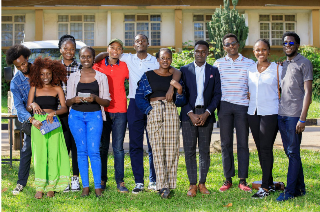
Students at the Nguvu Poetry Show

The Makerere Law Society, a union which brings together all SoL students organised the Nguvu Poetry Show which was held on the 7 th May 2023. The show included presentations by SoL students celebrating performances by renown and fine poets as well as music performances.