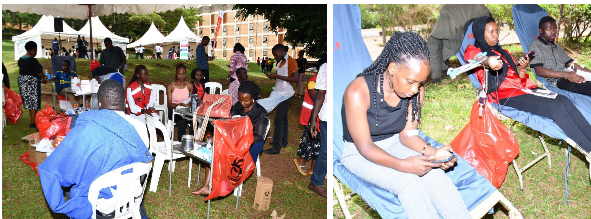
Participants at the Legal and Medical Camp donating blood

On 2nd and 3rd March 2023, Makerere Law Students in partnership with PILAC, the Students' Guild and Makerere University Hospital organized a legal aid and medical camp for not only students and staff of Makerere University but also for the general public.