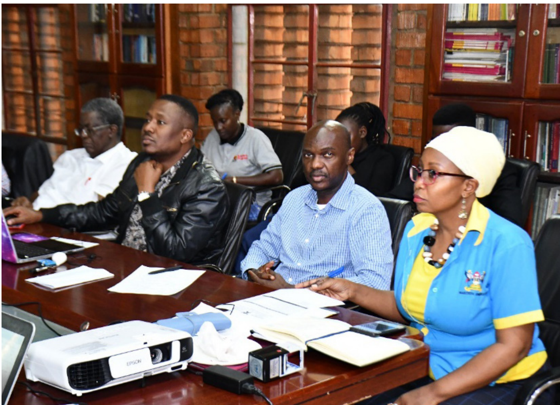
SoL Staff attending the Onlinisation Training

On 10 th March 2023, we had an onboard meeting/training about onlinization of our programmes. It was a successful training. Timelines for developing the initial courses were agreed to.