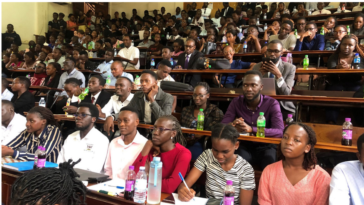
Participants at the Anti-Homosexuality Dialogue