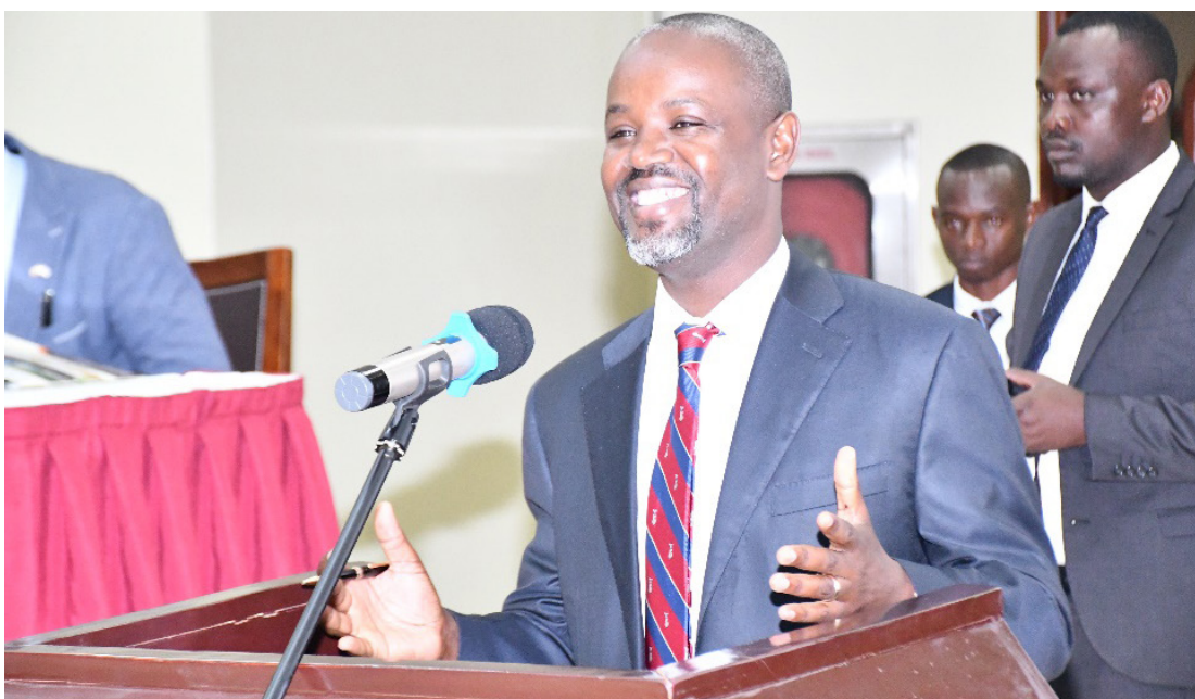
Rt. Hon Thomas Tayebwa giving remarks at the Covid19 report launch

Hon. Tayebwa further said, 'Parliament is ready to work with CSOs, researchers and academicians in understanding national issues better. This is because as observers they are in position to offer critical and objective analysis than executive or legislature who are implementers'. He noted that absence of transparency and accountability by government institutions affects Uganda's strategy to reach middle income status. Rt. Hon. Thomas Tayebwa commended HURIPEC and School of Law for the work that they do in protecting human rights of the people. Hon. Tayebwa who is an alumnus of SoL expressed his happiness to be back and excited to receive the recommendations of the report. The Deputy Speaker applauded the groundbreaking work and noted that this particular report is important because it is a useful contribution when Parliament reviews the Auditor General's forensic audit of Covid19 expenditure.