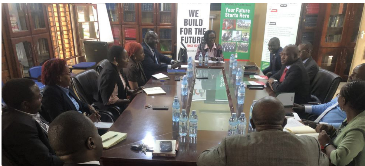
Mak SoL Staff Heads of departments during meeting with Mak Council Members

The Makerere University Council visited the School of Law (SoL), Makerere University on Monday, 27 th February 2023. Council members held a meeting with the School leadership including the Principal, Deputy Principal and Chairs of Departments.