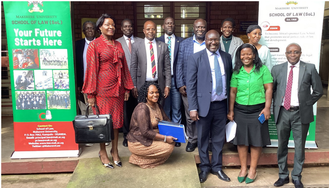
Group photo: SoL and DRGT staff