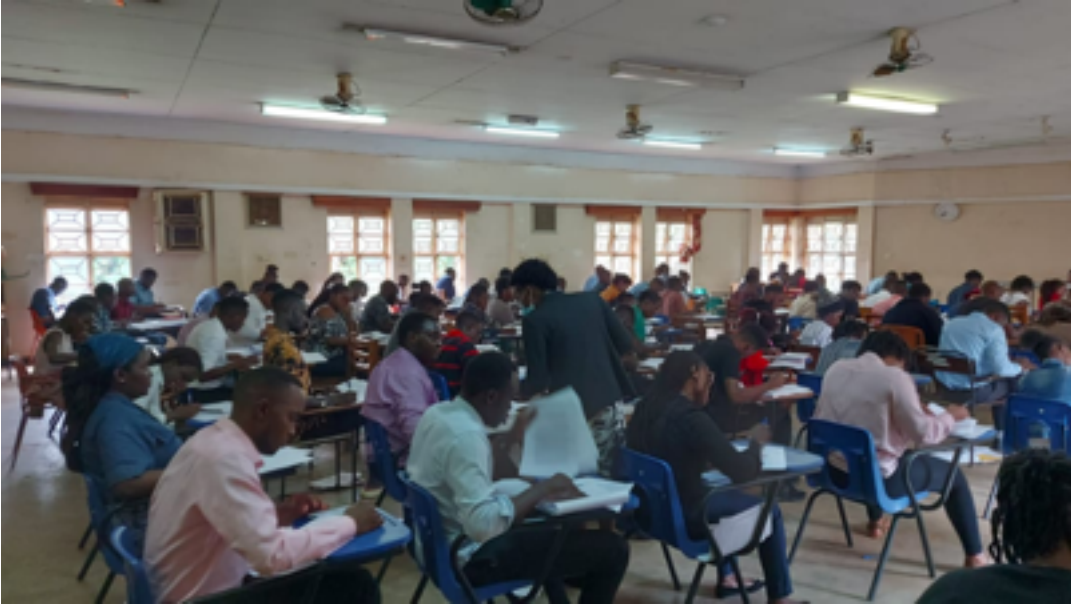
Students in an end of semester exam

Graduate Admission Test (GAT): The GAT is a requirement for students that apply to study from LLM at SoL. The test was held on the 17 th June 2023. A total of 189 applications for LLM in AY2023/2024 were received and sat for the test. A total of 91 candidates passed the GAT and have been admitted to the LLM programme.