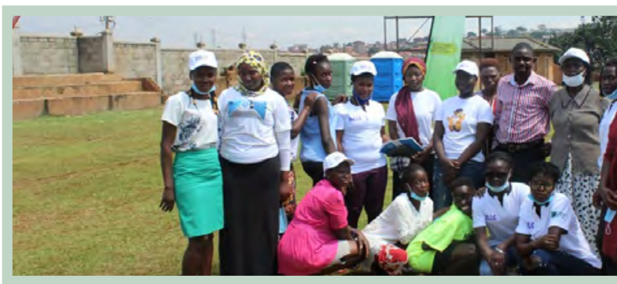
Students, Community Leaders, SCOs and Clients take off time to pose for a photo during the Legal Aid Day 2020 at Rugby grounds, Makerere University

The School of Law serves as a secretariat of the East African Network of University based Law Clinic. This is a forum that bring together law teaching Universities in the region offering legal aid services. It helps build synergies and pool resources to promote public interest lawyering in East Africa through Clinical legal education, joint research, study tours and public interest litigation among other activities.